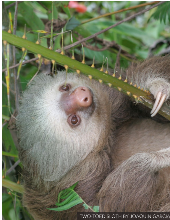
TWO-TOED SLOTH BY JOAQUIN GARCIA

Transfer approximately 1.5 hours to the international airport in Liberia. Check-out is at 12 pm. (B)