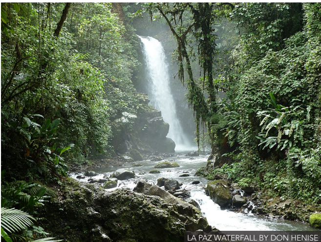
LA PAZ WATERFALL BY DON HENISE

Upon arrival, after clearing customs and immigration at the airport, meet your driver and transfer to Hotel Balmoral, situated in the heart of the city near the Gold Museum and the National Theater, along the city's famous pedestrian boulevard. Check-in starts at 2 pm. This evening, enjoy a welcome dinner and program orientation at El Patio featuring a variety of options including a full-service restaurant, pizzeria, coffee shop, bar, and wine cellar. In order to arrive in time for orientation, participants must book flights that arrive in San José no later than 4:30 pm. Overnight at Hotel Balmoral. (D)