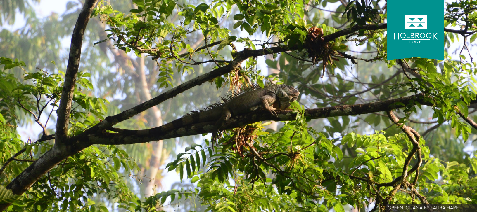
GREEN IGUANA