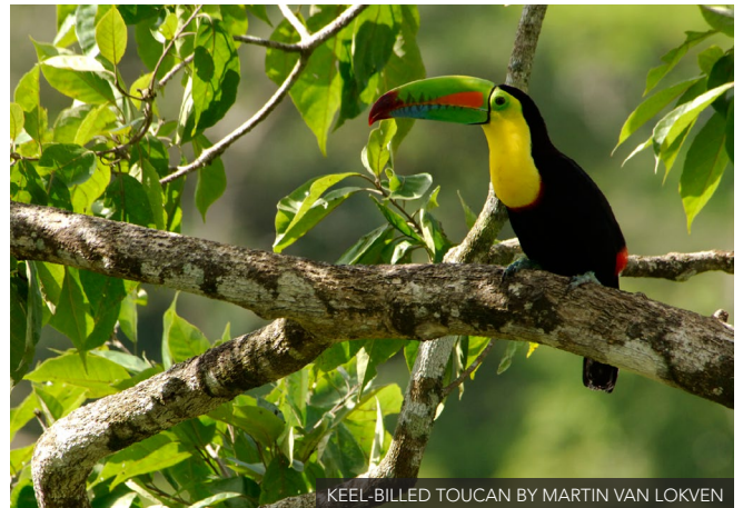
KEEL-BILLED TOUCAN