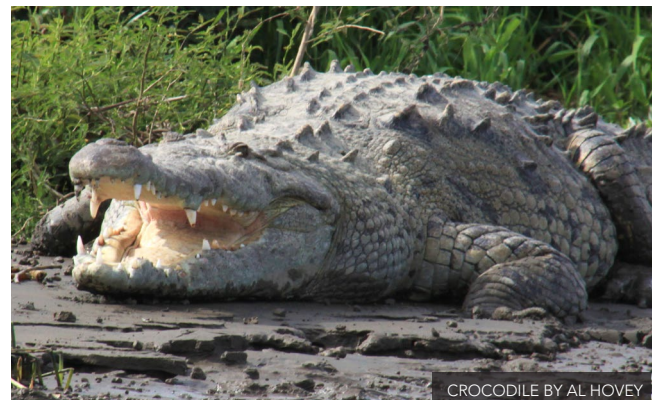
CROCODILE BY AL HOVEY