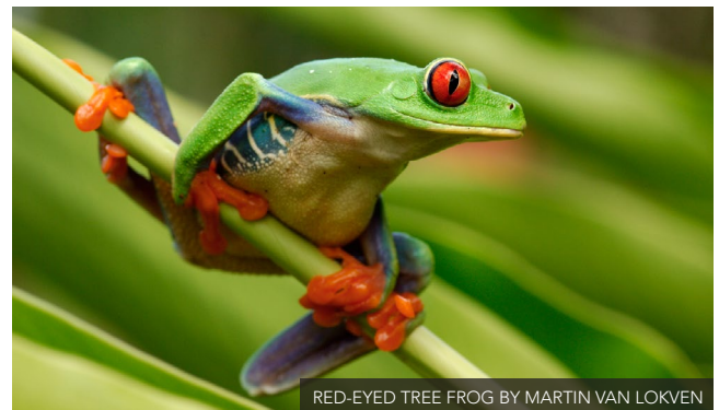
RED-EYED TREE FROG

This program features natural and cultural discovery in two iconic Costa Rican ecosystems: the rainforest and Pacific coast beaches. Daily activities include hikes of up to 3 hours along paved and unpaved forest trails. Some trails feature steps or suspension bridges, and some may be slippery or uneven. Other activities include a catamaran ride, during which you can swim and snorkel; swimming at hot springs; and whitewater rafting with minor class I, II, and III rapids. A professional river guide will escort you and conduct a safety lesson; all equipment is provided. Alternatively, you can opt for a standard boat ride. Expect high humidity with daytime temperatures ranging between 80° and 90° F. Elevation changes take you from sea level to altitudes of up to 3,300 feet. Travel between sites takes place on private, air-conditioned motorcoaches, and drive times range between 2 and 5 hours, on curvy mountain roads with stops en route.